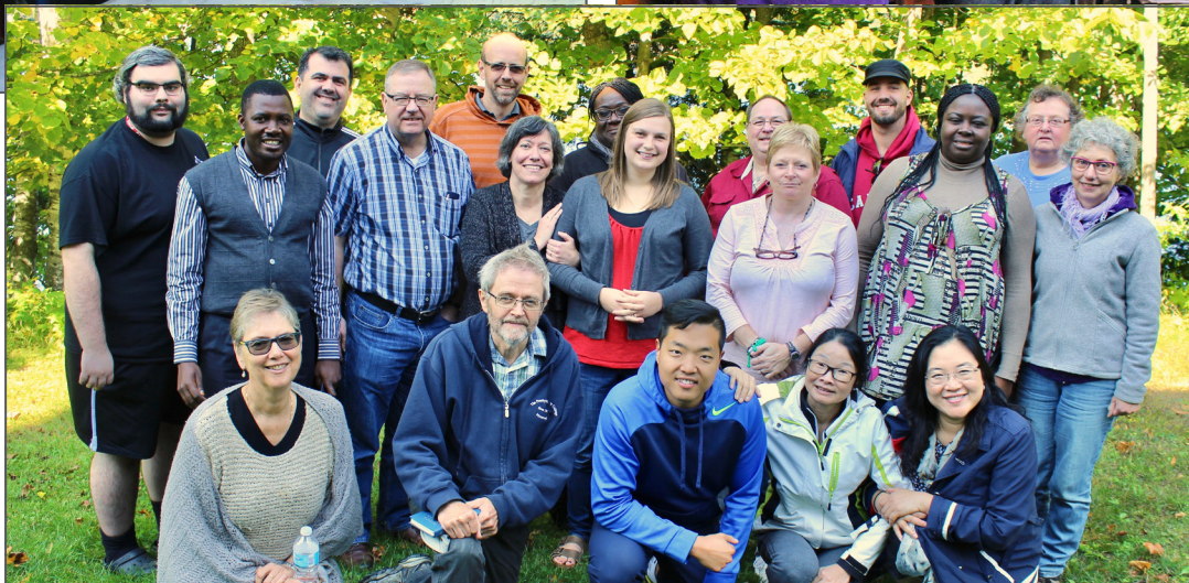
Students, staff, and faculty enjoy Presbyterian College's annual retreat along with the United Theological College and the Diocesan College in the Laurentians