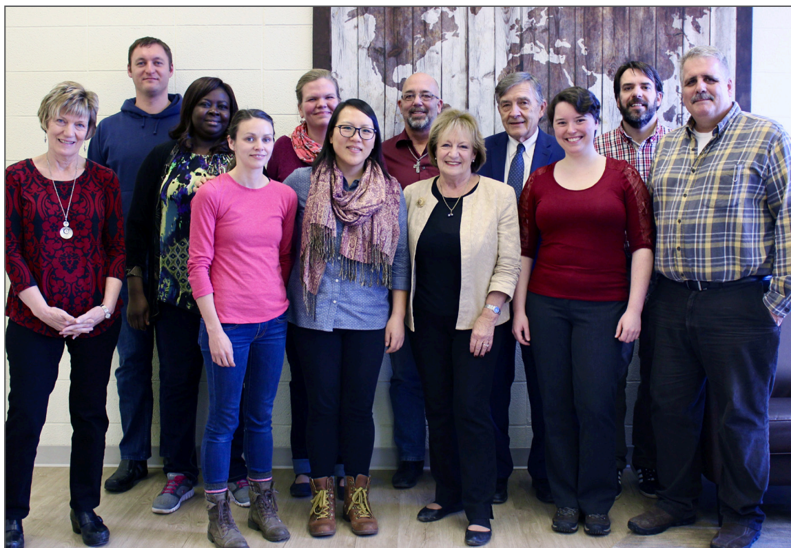
Dependable Strengths group training to become Facilitators